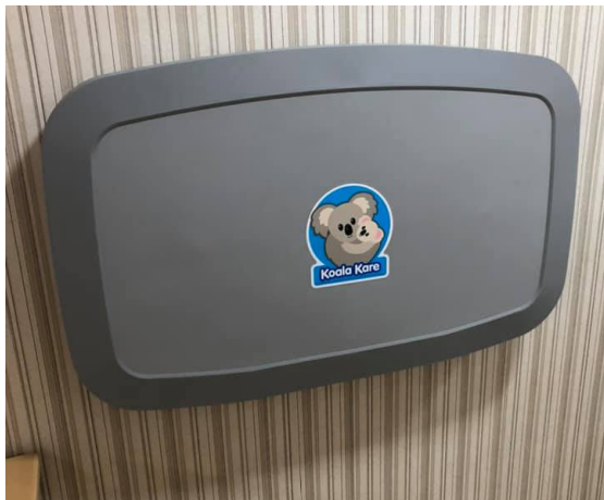
Top Picture: Baby Changing Station Bottom Picture: Mary Neville Project Progress

Keep checking the Upcoming Features section for more new and exciting things coming to the library!