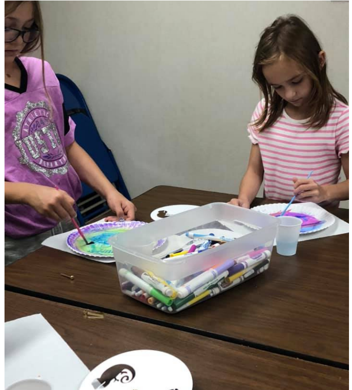
End of Summer Reading Program Party Craft - Chameleon Paper Plate Spinners